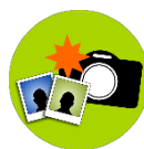
PHOTO DIRECTORY - The Knox Church Photo

Directory is here! If you had your picture taken by Universal Portrait Studios then you are entitled to a free copy. Pick up the copy with your name on it from the